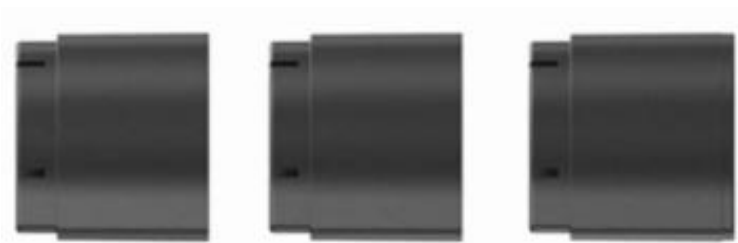
Figure 4: 3 leg segments

There are 12 leg segments for this product. A leg segment adds height to this table according to user's desirable height. Each segment is about 1.7" high and comes in curved design which presents an aesthetic look. The segments are made from ABS plastic as well. When added to the surface of the table, they can hold up to 44 lbs of weight.