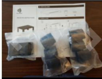
Figure 6: Each leg in its own packet