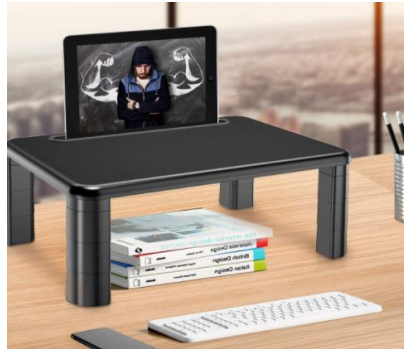
Figure 5: The platform gap holding a tablet.

The gap provided on top of the platform is keep the extra devices a user may have. This gap has many purposes.