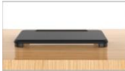
Figure 3: An example of the flat surface of the table with the leg segments

Top, the flat surface of the table (also known as platform): This surface is 11" high and 15.7" wide. The size of the surface allows you to keep the monitor screens, laptops, and printers secure. The surface is made from ABS plastic, which means that it is strong enough to hold any object up to 44 pounds.