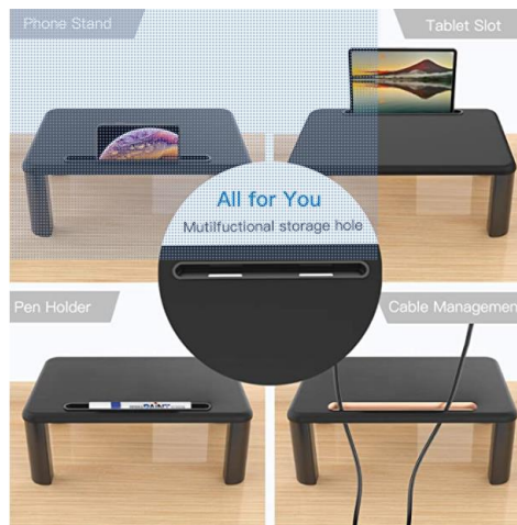
Figure 8: Different ways to use the tablet/phone holder

There are many ways to arrange the monitor riser. Refer to figure 9. If the user wishes to use the cable management feature, then the user would have to pass the wires through the gap provided. The gap is 1" wide.