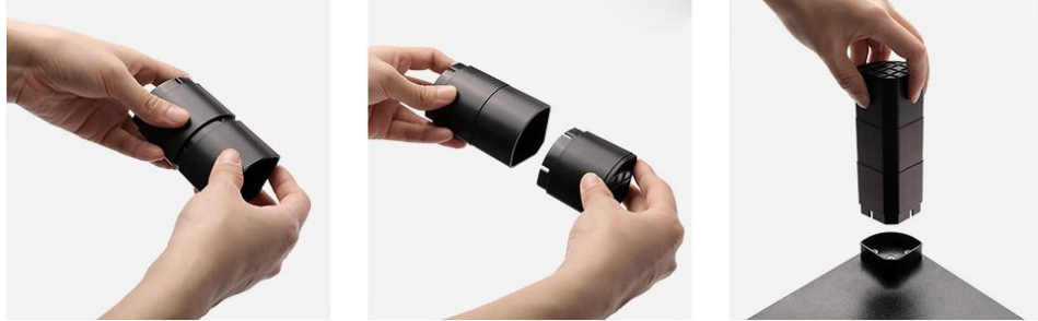
Figure 7: Showing the assembly process