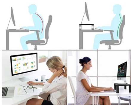
Figure 2: How the monitor riser improves back issues

Raise screen at an ergonomic height to relieve pain on your back & neck